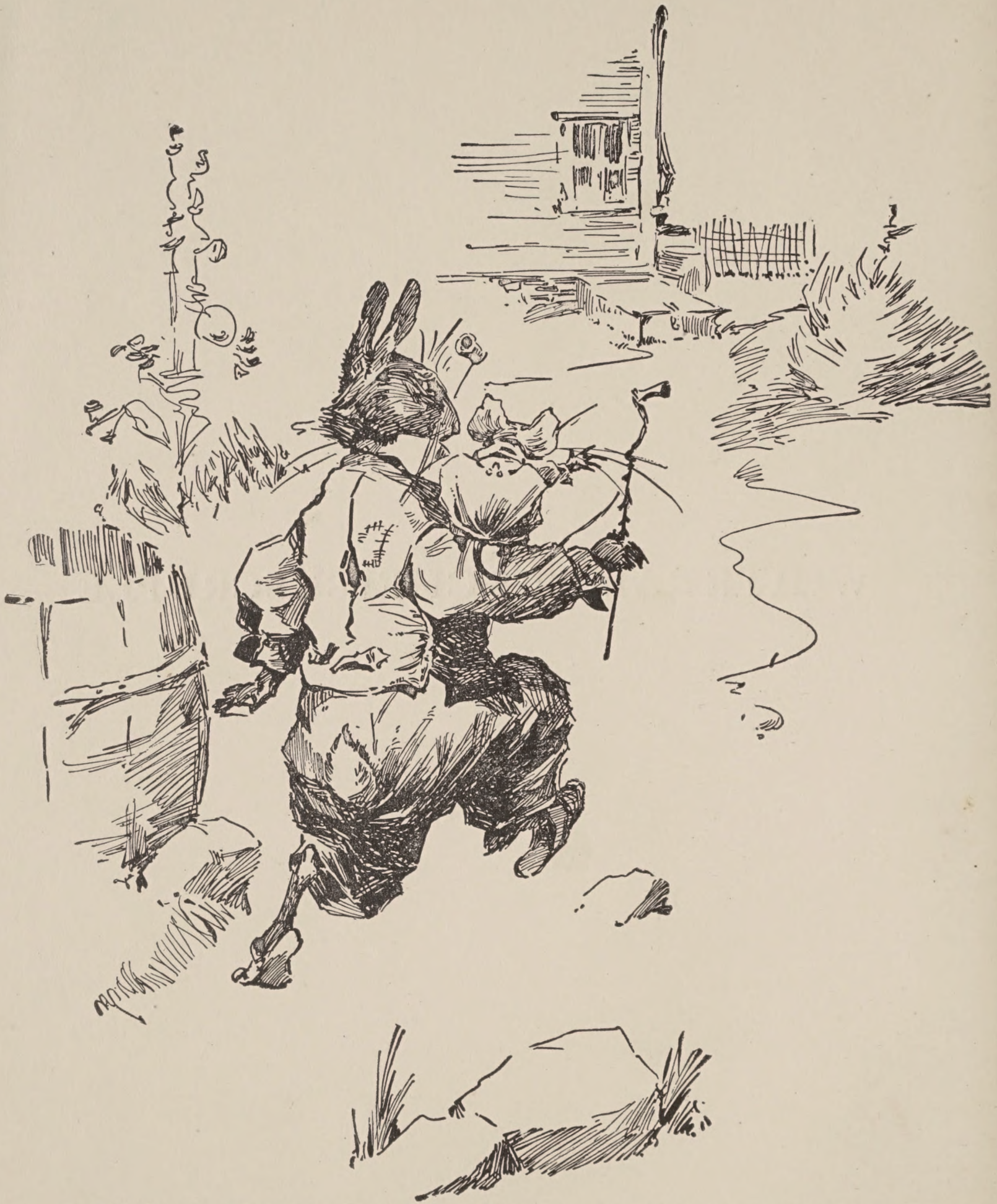
WHITE RABBIT AND GRAY MOUSE GO TO THE CELLAR.